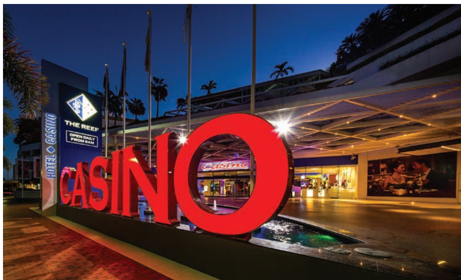
Casino Porte Cochère