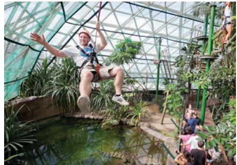
Cairns Zoom & Wild Life Dome