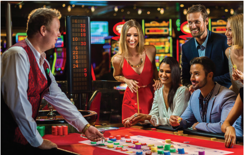
Casino Table Gaming

Details of the fees payable by the Trust to the Responsible Entity are contained in note 15 to the financial statements and in the Directors' Report on page 13.