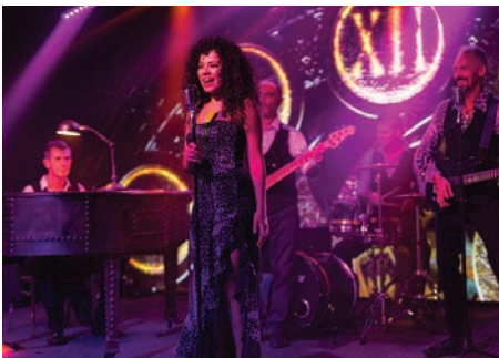
BAR36 Live Entertainment