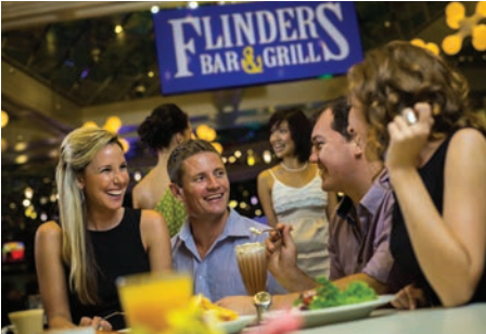
Flinders Bar & Grill

The Pullman Reef Hotel Casino features 128 luxury guest rooms and suites each offering charm, elegance and tranquility. Their decor accentuates the feel and lifestyle of Tropical North Queensland. Pullman facilities include swimming pool and spa, health club, and tour desk.