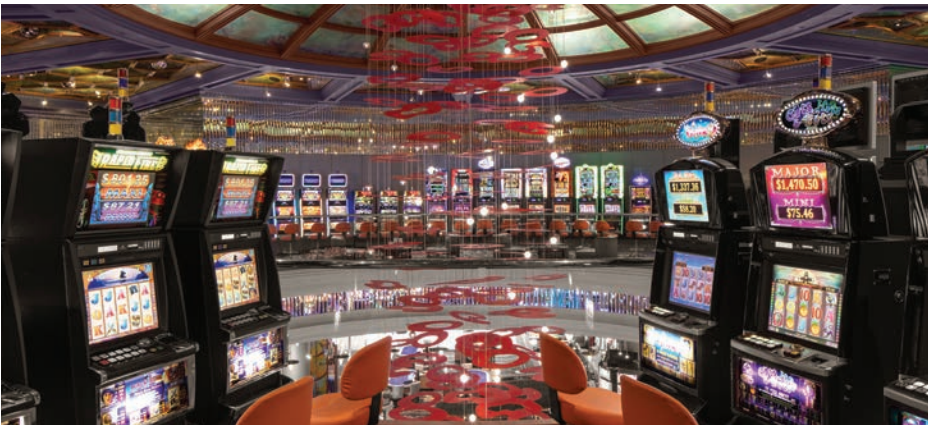
Casino Gaming Machines