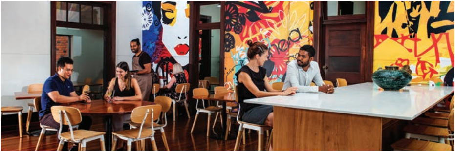
Soy Kitchen Street Food