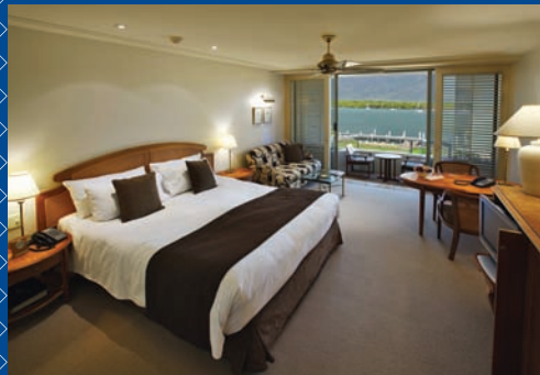
Gaming Tables (left) and (right from top) Tamarind Restaurant and Pullman Guest Suite