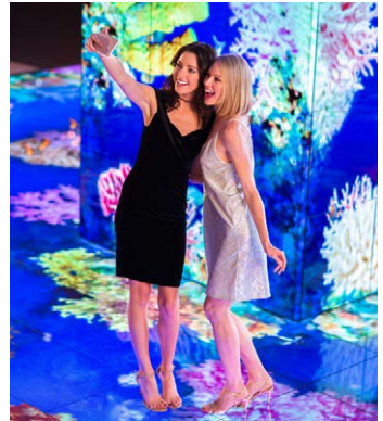
LED Pillar & Interactive Floor