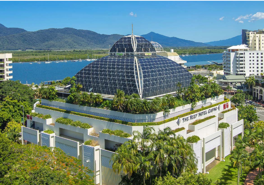
The Reef Hotel Casino

Details of the fees payable by the Trust to the Responsible Entity are contained in note 15 to the financial statements and in the Directors' Report on page 11.